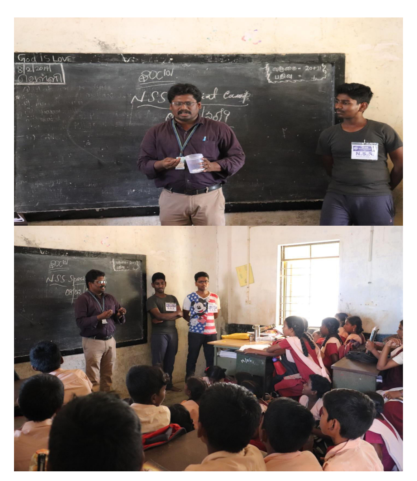
SCIENCE AND GAMES

Place: Government Middle & Primary School Students