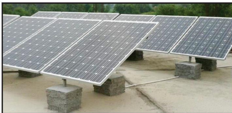
Solar panels installed