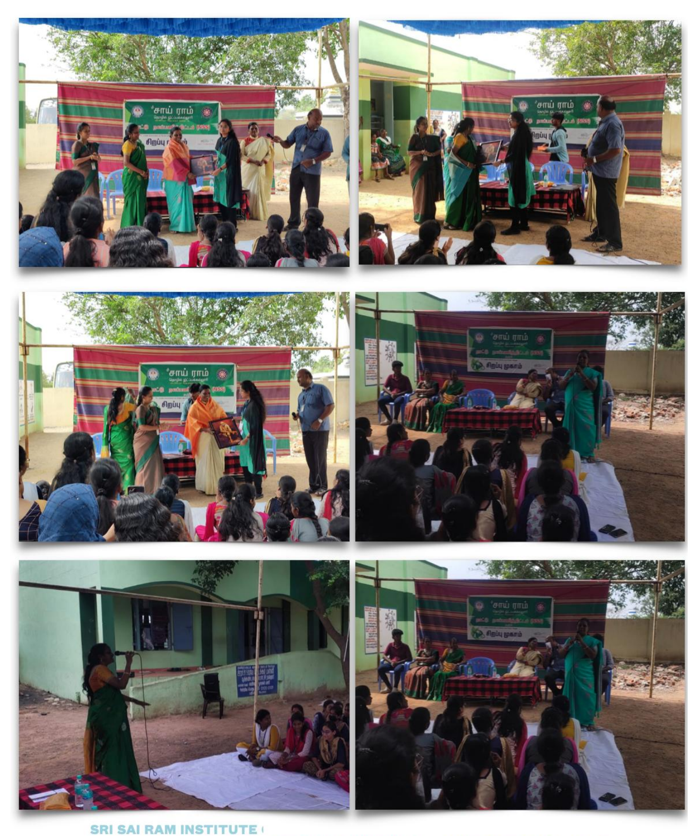
TECHNOLOGY, CHENNAI REGION : CHENNAI NSS CODE NO : 1095