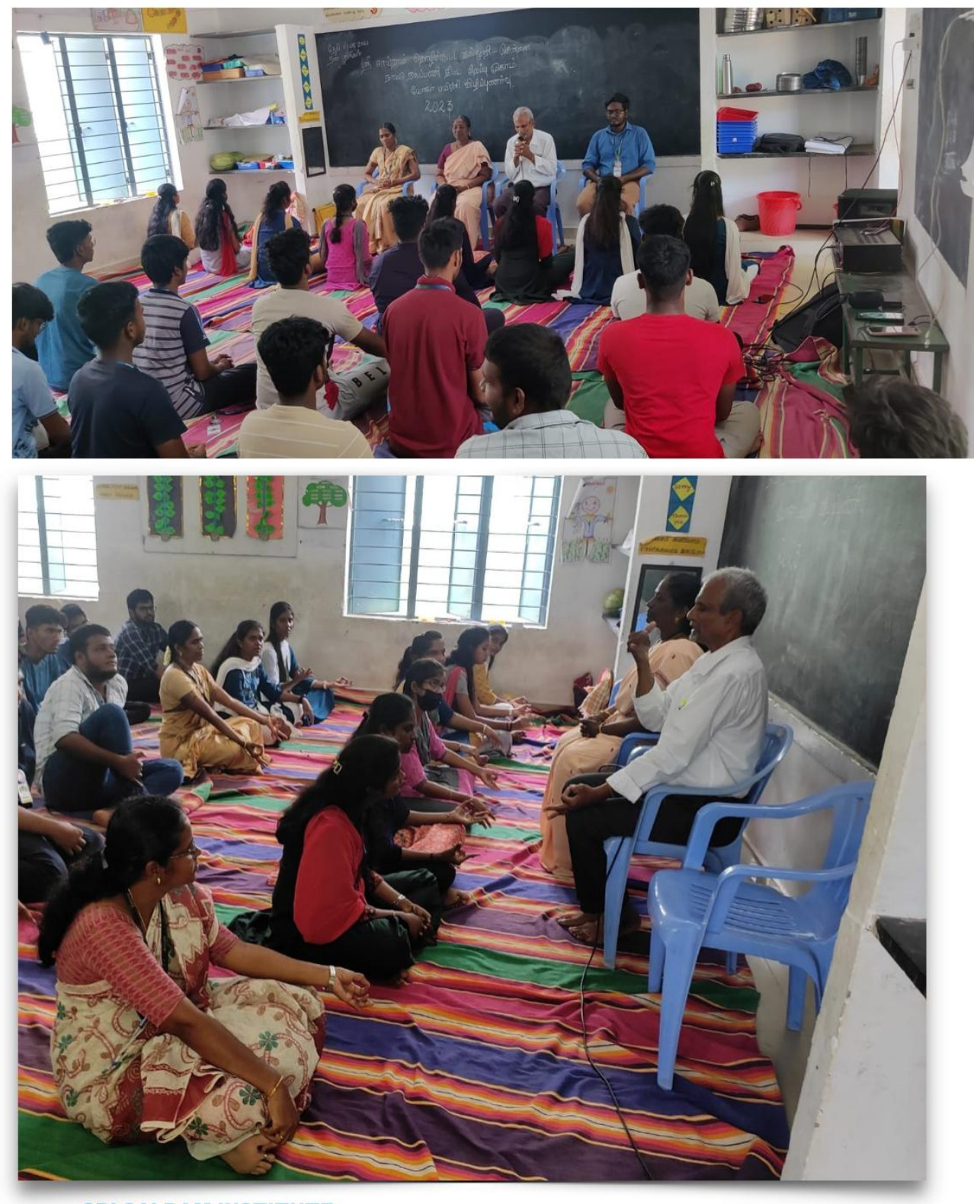
SRI SAI RAM INSTITUTE ( TECHNOLOGY, CHENNAI REGION : CHENNAI NSS CODE NO : 1095