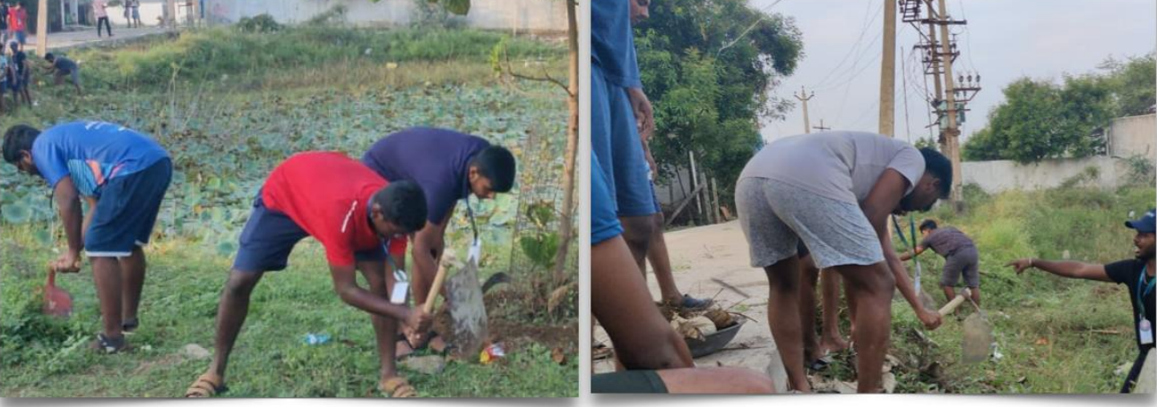
SRI SAI RAM INSTITUTE ( TECHNOLOGY, CHENNAI REGION : CHENNAI NSS CODE NO : 1095